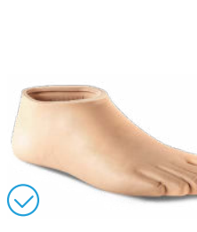
DYNASTEP (With Multi-axis Ankle Kit*)