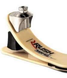
RUSH RAMPAGE® LP