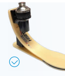
RUSH ROGUE® 2